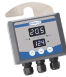
FERMFLEX - STANDARD

All temperature settings can be made directly on the controller or optionally via the FERM-Software from the server PC in the office or remotely using a laptop, tablet, or mobile phone over the internet. (Option) Control via the software also offers the advantage of data documentation and storage. The FERMFLEX-STANDARD controllers can also be locked with a code - individually or simultaneously via the bus - to protect against unauthorized operation. They can also be fully integrated into the VinInfo bus system.